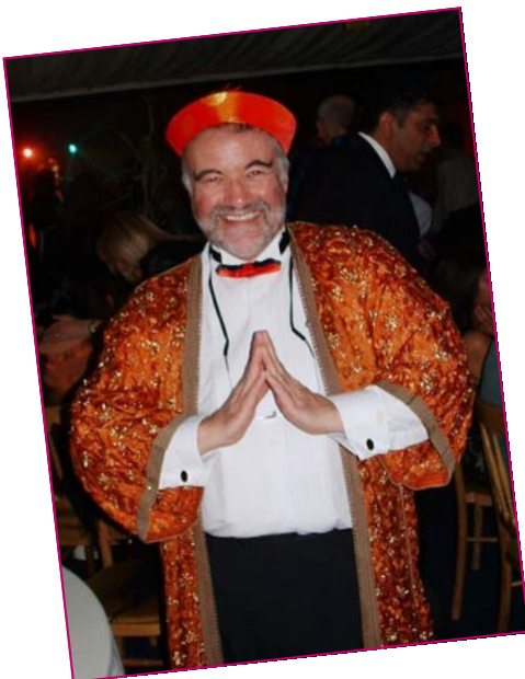
Haresfoot School Sleepover & Chinese Ball