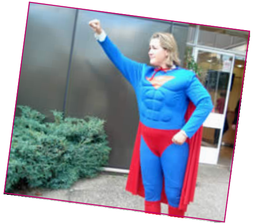
Cavendish School 'Wacky Week'