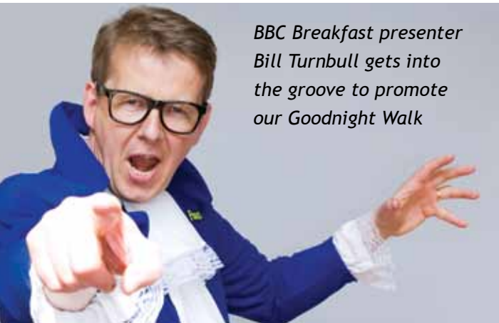
BBC Breakfast presenter Bill Turnbull gets into the groove to promote our Goodnight Walk

We are very fortunate to benefit from the support of local celebrities such as Fern Britton, John Bly, Peter Drury, Bill Giles, Geoffrey Palmer, Graham Poll and Bill Turnbull.