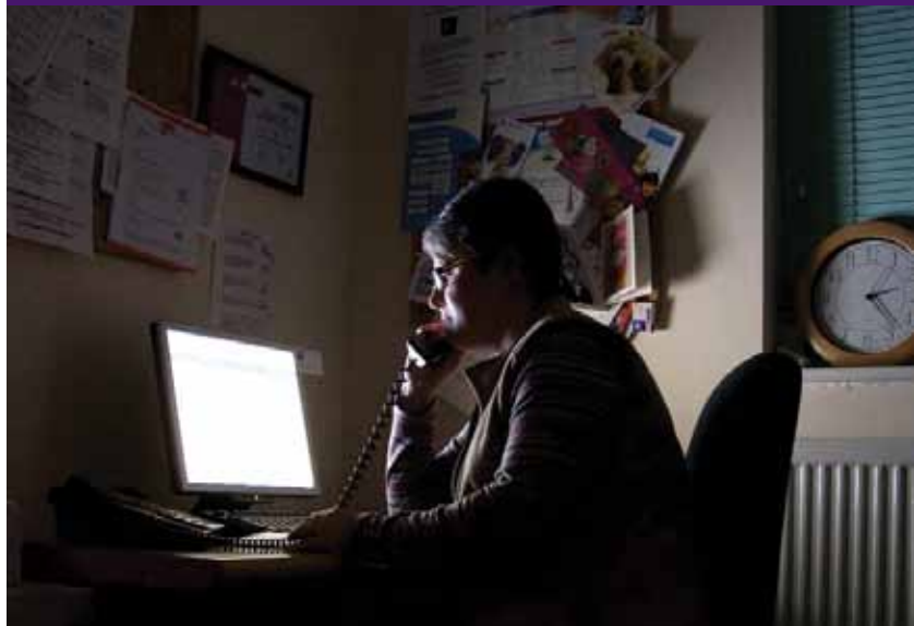
A pilot scheme trialled a waking night shift and extended evening shift, eliminating waiting lists.