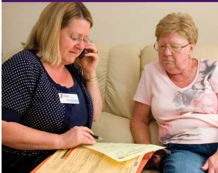
Our nurses continued to liaise with other healthcare professionals on behalf of patients.