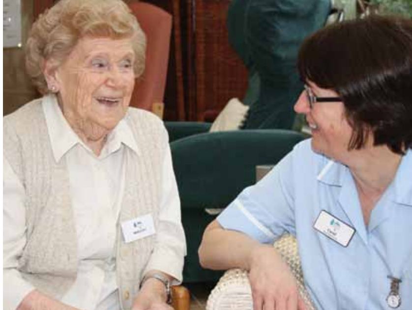
Day hospice care at Grove House can help eliminate hospital admissions for many patients with long-term life-limiting conditions.