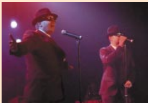
• The Bootleg Blues Brothers hit Berkhamsted

The evening of Sunday 13th March was certainly enjoyed by over 250 people who attended the Bootleg Blues Brothers gig at Berkhamsted Collegiate School in aid of the Pepper Foundation which supports the IRHH's Pepper paediatric nurses.