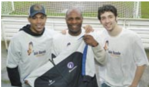
L-R: MC Harvey, Luther Blisset and Ralf Little at Chesham United

For tickets, please contact the fundraising team at the Iain Rennie Hospice at Home on 01442 890222 or email hasquith@irhh.org . See www.irhh.org for more information including celebrities taking part and photographs of the team. Family tickets (2 adults, 3 children) cost £10, adults £5, children £2.50.