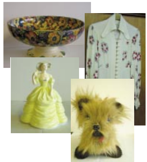
• Clockwise from top left: Early Royal Doulton Fruit Bowl; Early 1970's Ossie Clarke Dress; Late 1960's Merrythought Yorkshire Terrier; Coalport Figurine- Catriona

Below are a few of the more interesting items we have for sale or have sold on eBay!