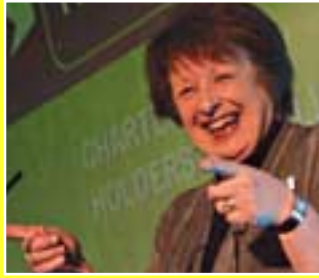
• Making a point at a recent conference to promote Charter Mark

messages along these lines have been sent to the Department of Health and the Cancer Networks and as a result some reallocation of the funds has been discussed so that current service provision is addressed. In the meantime the general service agreements are being uplifted by around 3.5%, when the cost pressures on salaries alone are running at around 6.5% - 7% - you don't need to be a statistician to see that the gap is increasing markedly.