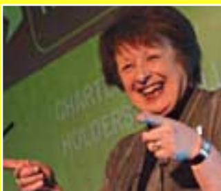
• Making a point at a recent conference to promote Charter Mark

messages along these lines have been sent to the Department of Health and the Cancer Networks and as a result some reallocation of the funds has been discussed so that current service provision is addressed. In the meantime the general service agreements are being uplifted by around 3.5%, when the cost pressures on salaries alone are running at around 6.5% - 7% - you don't need to be a statistician to see that the gap is increasing markedly.