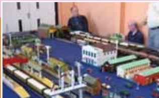
Over 250 people attend an exhibition by the Risborough & District Model Railway Club and the Hornby Railway Collectors Association, raising £436.89 for IRHH