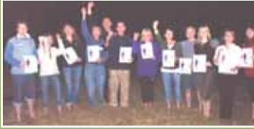
A team of IRHH supporters and staff walk across hot coals at our Firewalk raising over £2,700

Tring Angling Club organise a free half-day fishing event for youngsters at Wilstone with proceeds coming to IRHH.