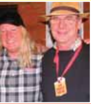
Squash Club gathers at Aldbury Trooper in Aldbury Hillbillies, raising

We are grateful to all the volunteers who helped at these events, and to everyone who visited our stalls.