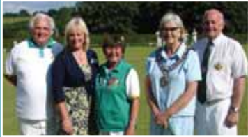
Chesham Bowling Club raise £1,790 from various fundraising activities, fines and a charity match.

The IRHH Fundraising team attended various fetes across the region last summer, selling merchandise, running tombolas, taking photographs for The Bigger Picture. Venues included the Lions Fete in Berkhamsted, Gadebridge Park in Hemel Hempstead, the Bucks County Show and the Beaconsfield Country Fayre, which included the return of the popular Stretcher Race.